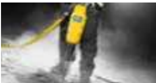
7 bar: Handheld tools