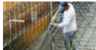
7 to 12 bar: Shotcrete applications