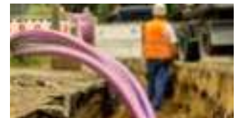
12 to 14 bar: Cable blowing and drilling