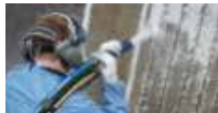
8.6 to 10 bar: Abrasive blasting