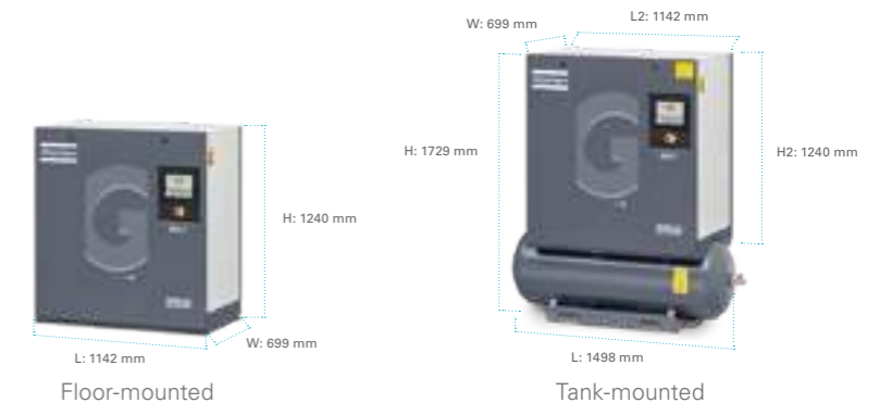
GA 5-7-11 pack (tank-mounted)