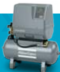
LFx Tank Mounted